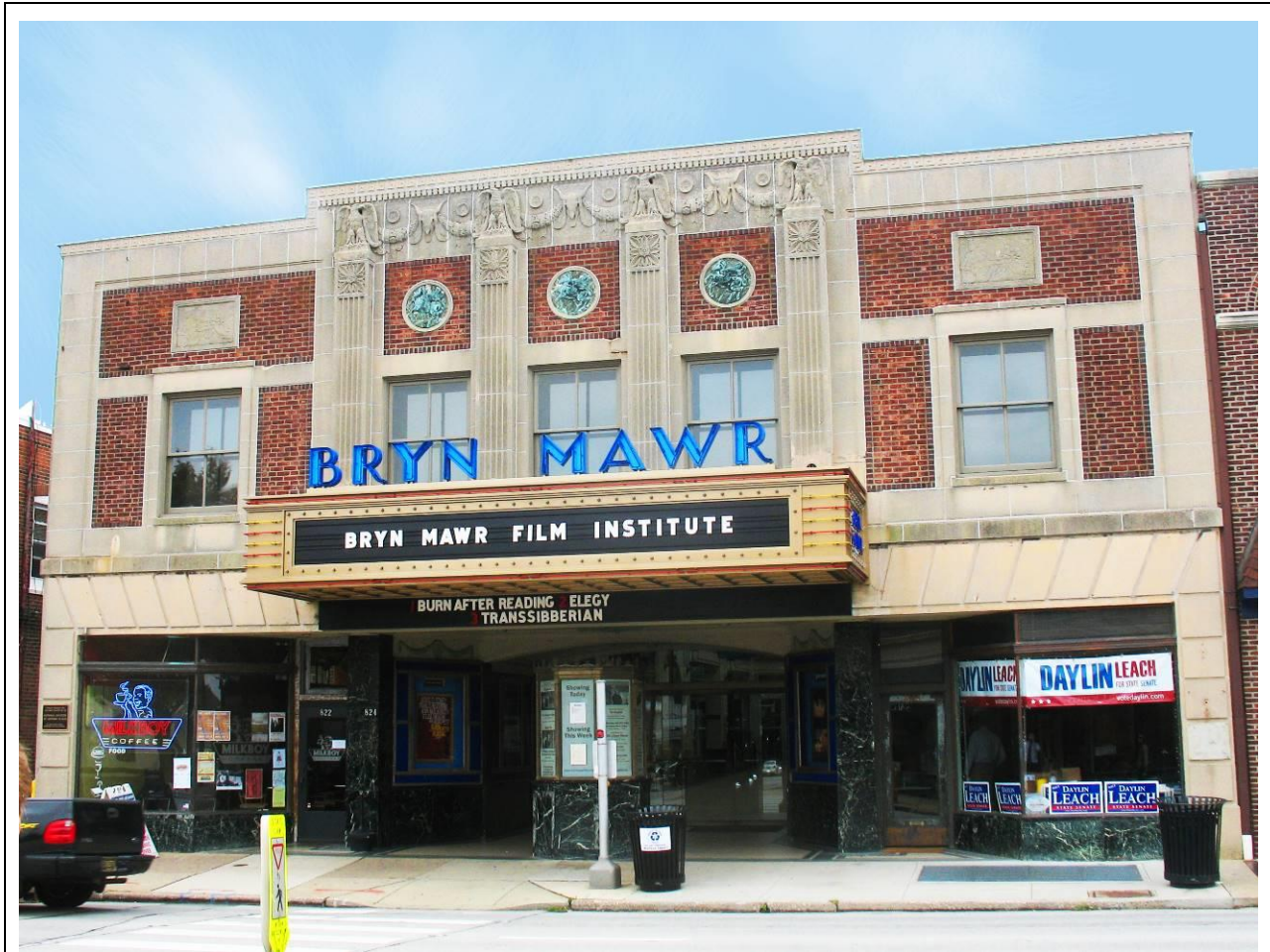
The Bryn Mawr Film Institute