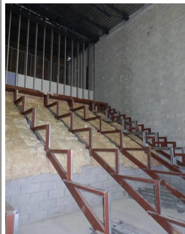
Structural detail of a raked floor for theater seating above. Construction of addition on right.