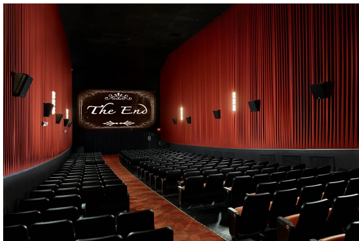
New rear lobby and newly renovated existing theater