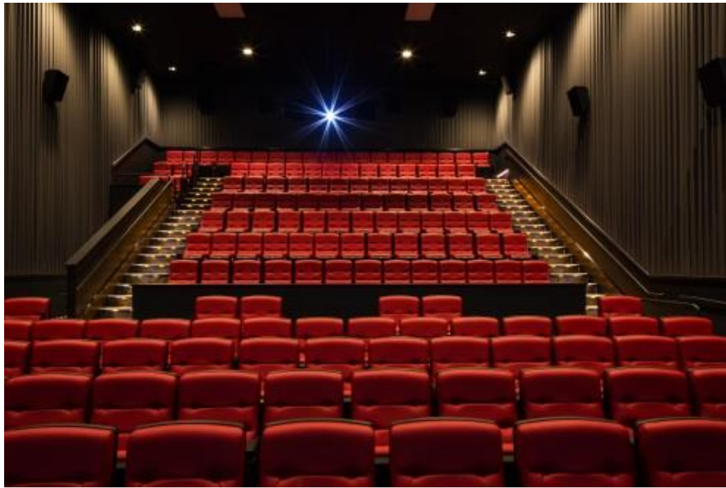
Two new theaters