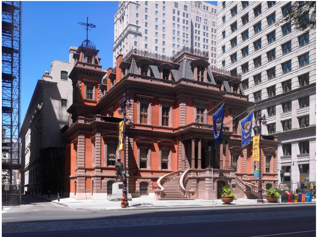
The Union League