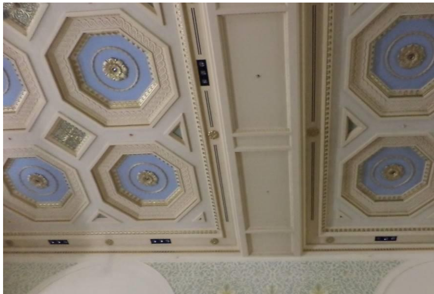
Construction and ceiling detail