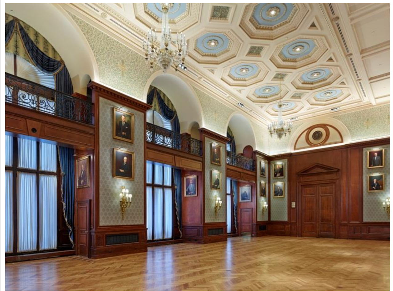
The Union League Lincoln Ballroom