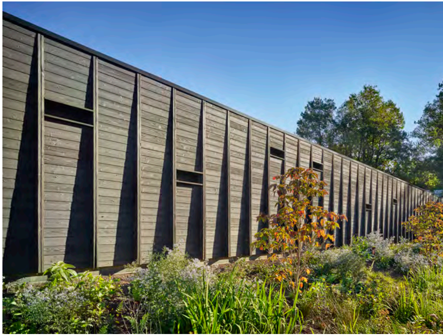
Shou Sugi Ban exterior cladding