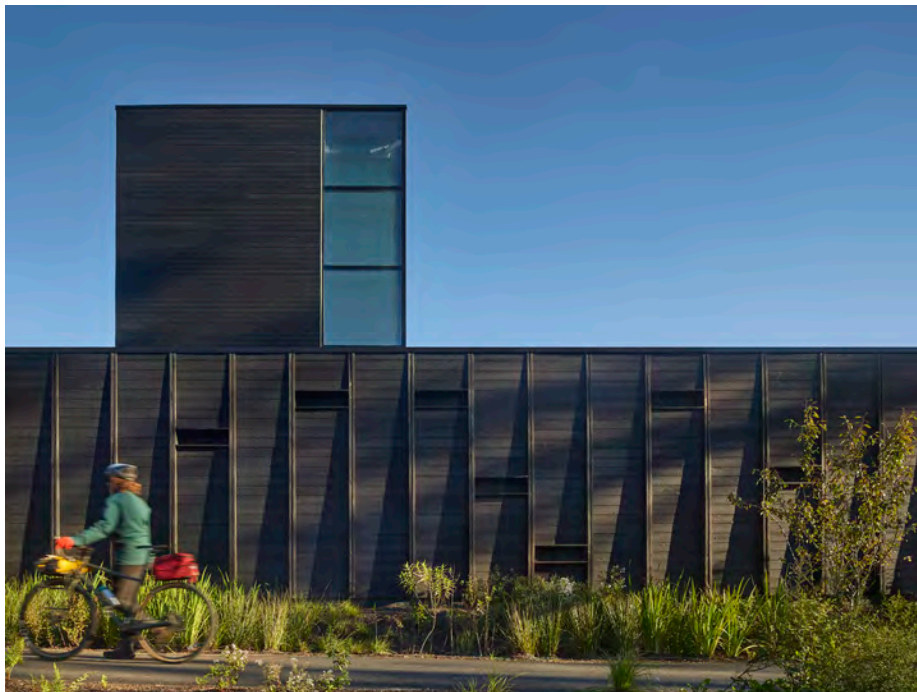
Shou Sugi Ban exterior cladding with climbing tower corner window