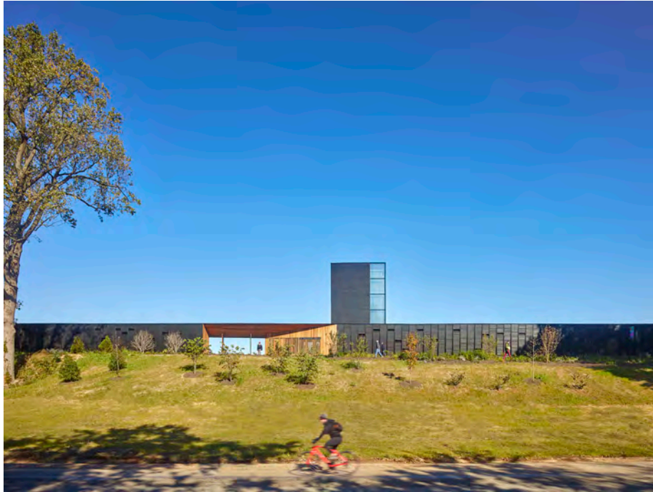
North Elevation from Reservoir Drive