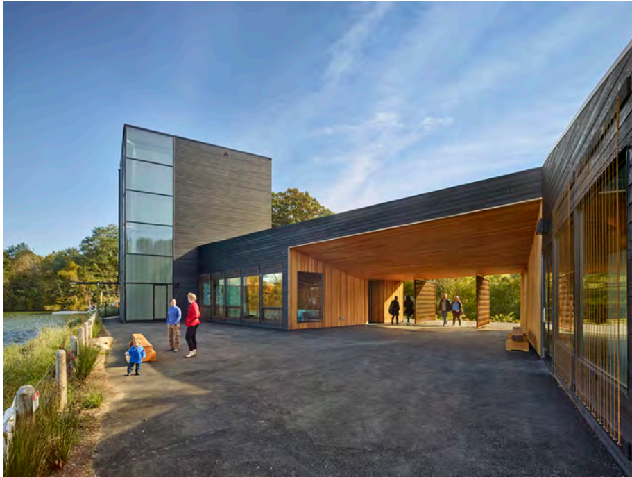
South Elevation with climbing tower and breezeway