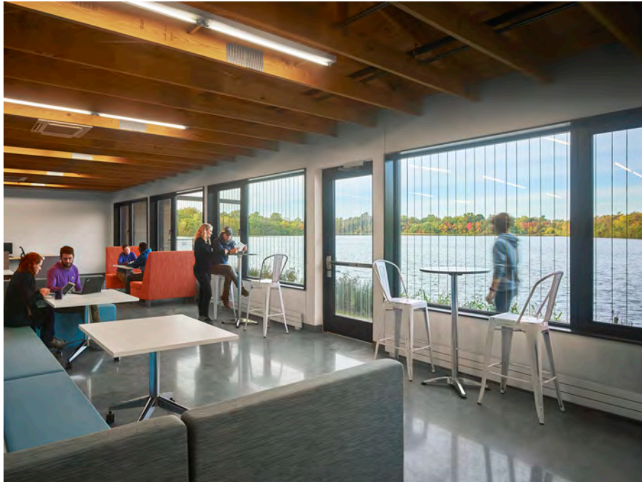
Interior with exposed roof framing and bird strike protection (low tech) on windows