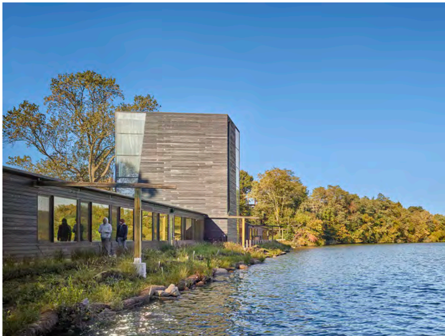
South Elevation showing proximity to water with climbing tower, wood framed rain leaders supported on existing reservoir lining slabs