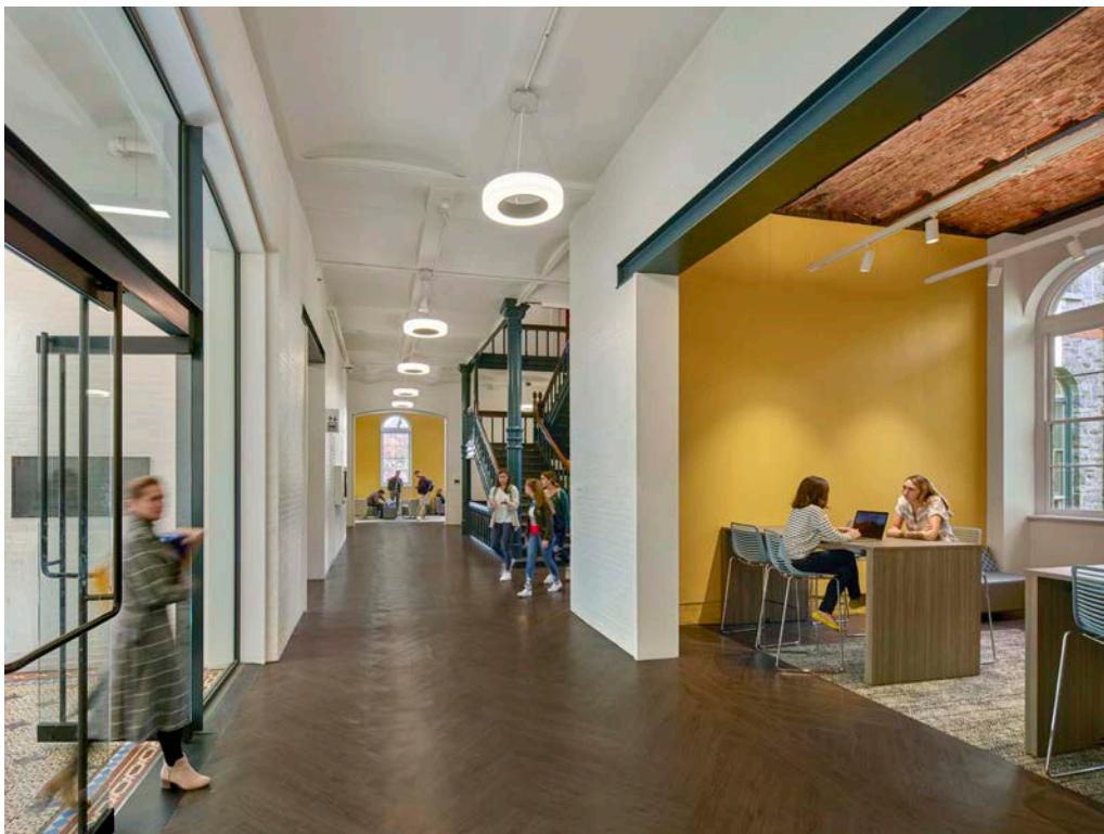
At top, Lehigh's Chandler-Ullmann Hall. Above, architecturally-exposed lintel and brick floor arches.