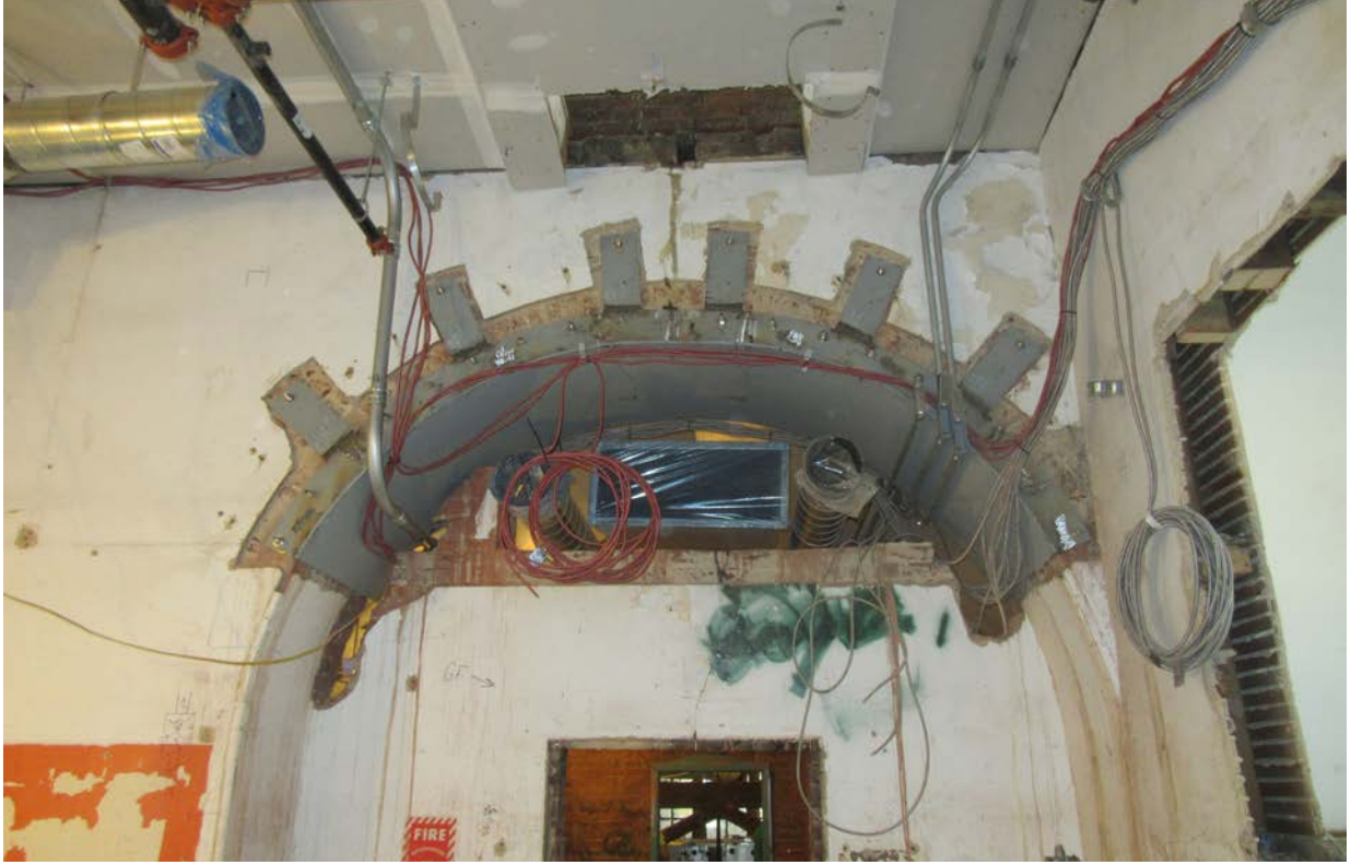
Opening created in 32"-thick masonry wall with new lintel.