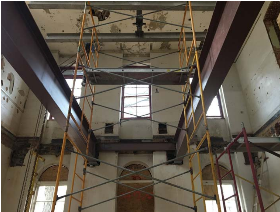
Existing floor framing and support columns were removed, with new floor framing (below) allowing for the creation of an open classroom space.