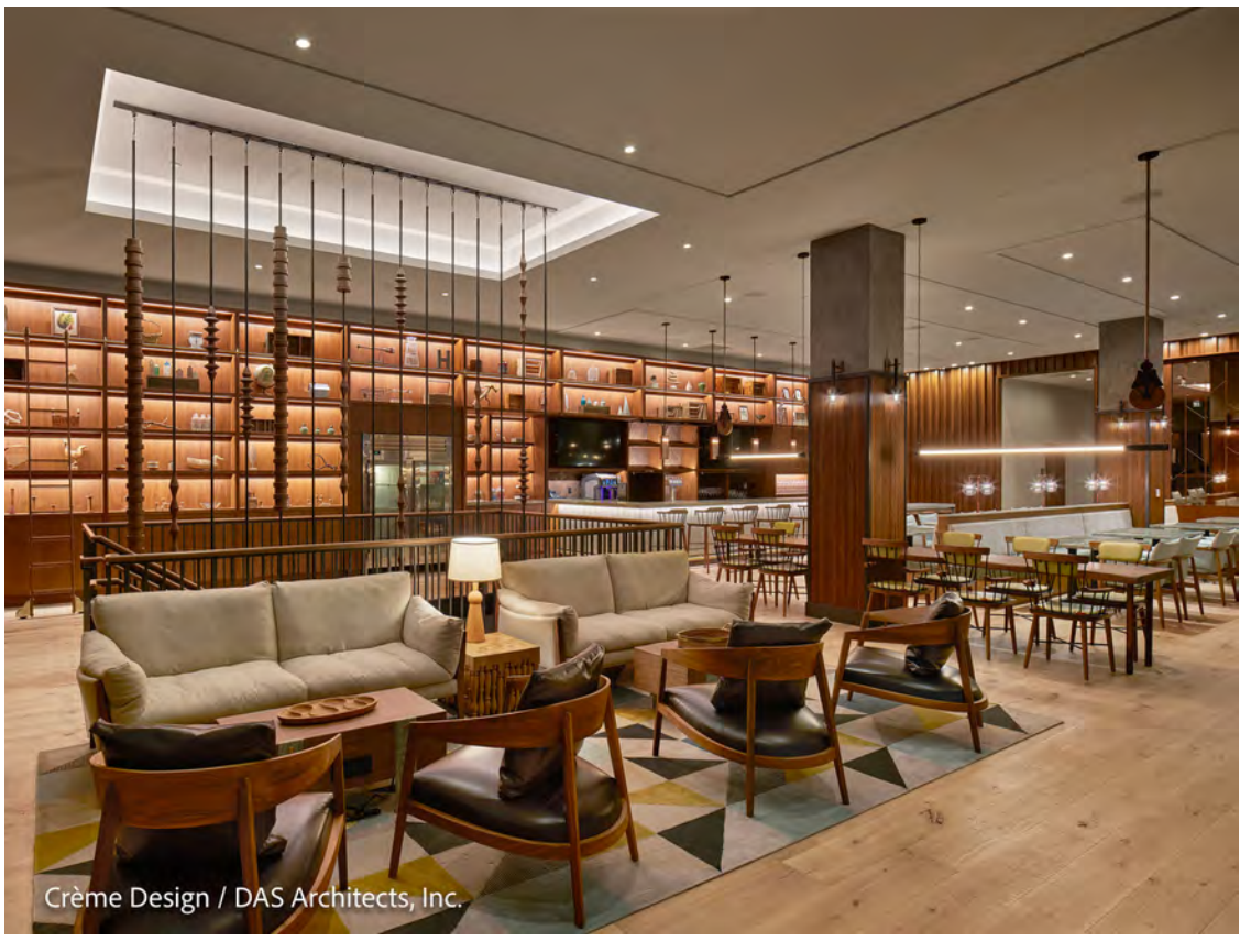
Crème Design / DAS Architects, Inc.